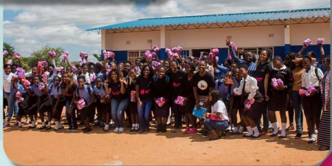
FACC Help Her Stay in School and Restore her dignity