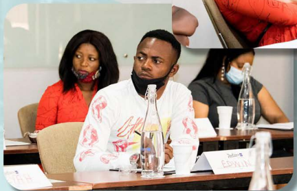
FACC at the AQESA Zambia Consultive forum on Eastern & Southern Africa (ESA) Commitments