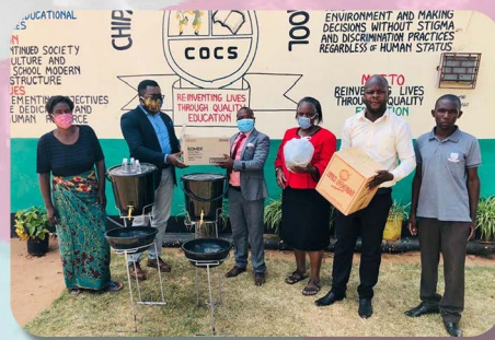
FACC Donation of COVID-19 prevention materials to COCS