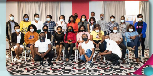
FACC at the AQESA Zambia Consultive forum on Eastern & Southern Africa (ESA) Commitments